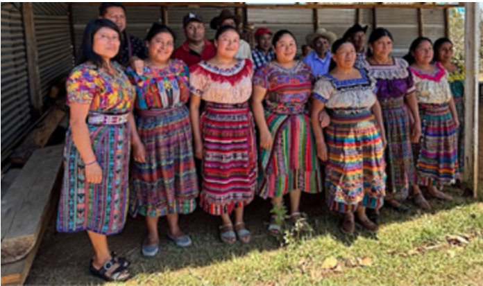
The women and men of Chuacaman III.

Together, we can make an awesome difference! ●