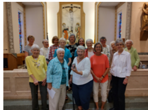
(L to R): Participants of the Sisters Speak Out event in Effingham, Illinois.

More than anything, I pray that you continue to recognize the power of your baptismal call to proclaim the Good News and courageously hope and act out of how God calls you in these times. May you know that you are not alone in your desires to live out God’s dream for flourishing of all people and creation.