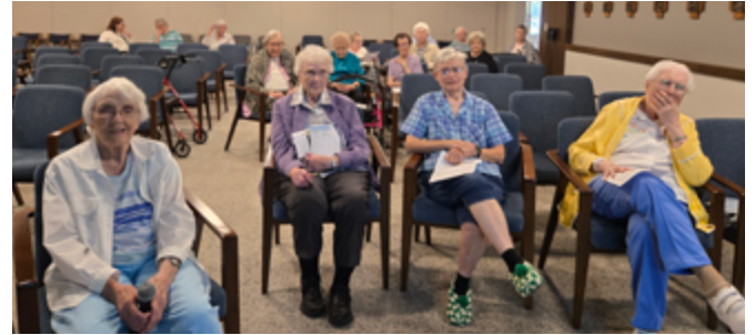
Sisters at Trinity Woods, Milwaukee, participate in The Gathering online.