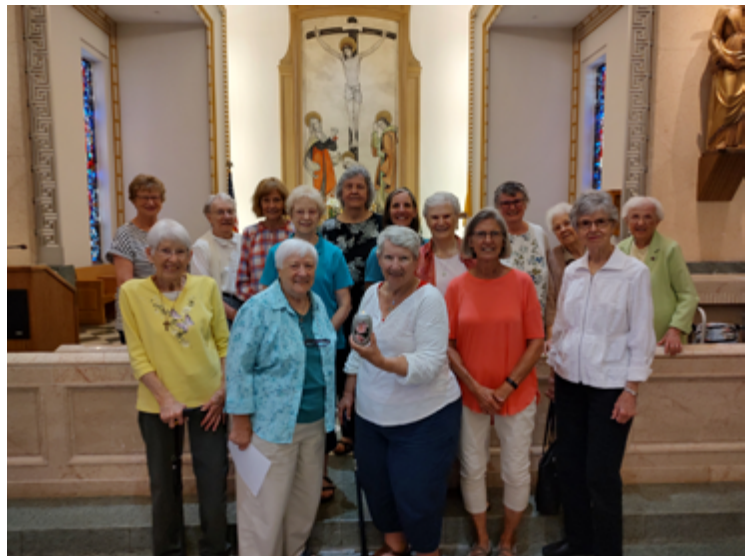
Sisters, associates and friends gathered with community members and sisters across the U.S. to pray for the country in Effingham, Illinois.