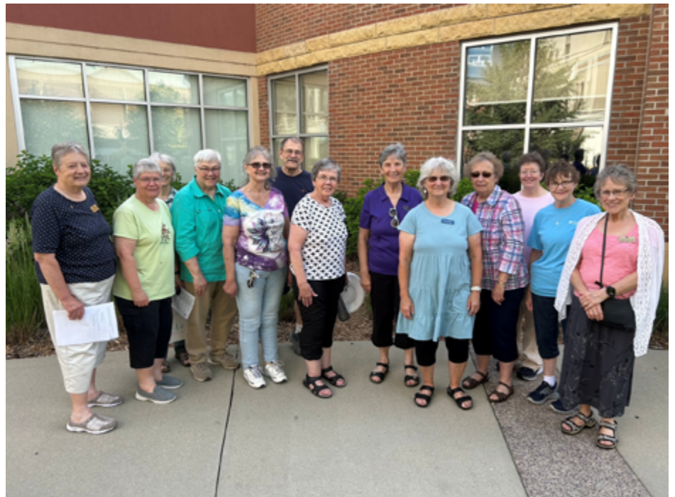
Mankato area sisters and associates gather with area faith leaders to oppose federal budget cuts.

** If you have viewed 5 or more articles from The Free Press this month, you may not be able to view the above article without a paid subscription.