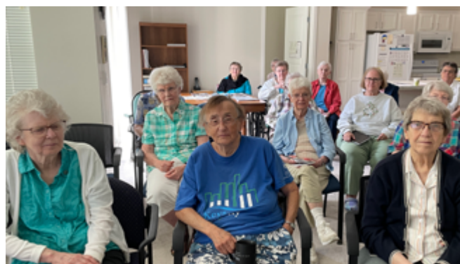
Sisters at Benedictine Living Community, Shakopee, Minnesota, participate in The Gathering online.