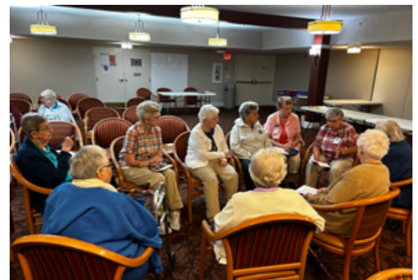
Sisters from The Sarah Community, Bridgeton, Missouri, participate in The Gathering online.